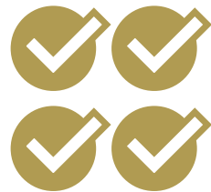
Choice of 4 different benefit levels