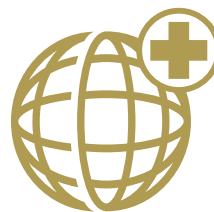
Worldwide emergency assistance 3