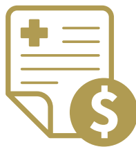
No claim discount 2