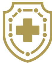
Guaranteed renewability 1