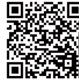
AXA WiseGuard Pro Medical Insurance Plan