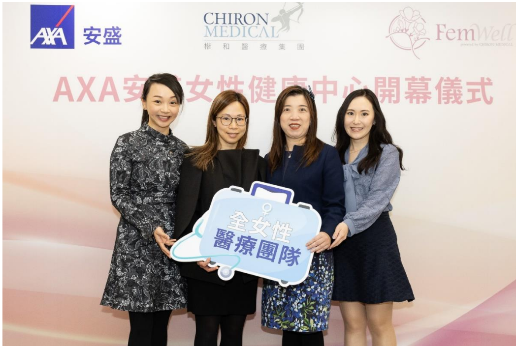
Photo 2: AXA Women's Health Centre is managed by a team of dedicated female medical professionals who provide attentive care.