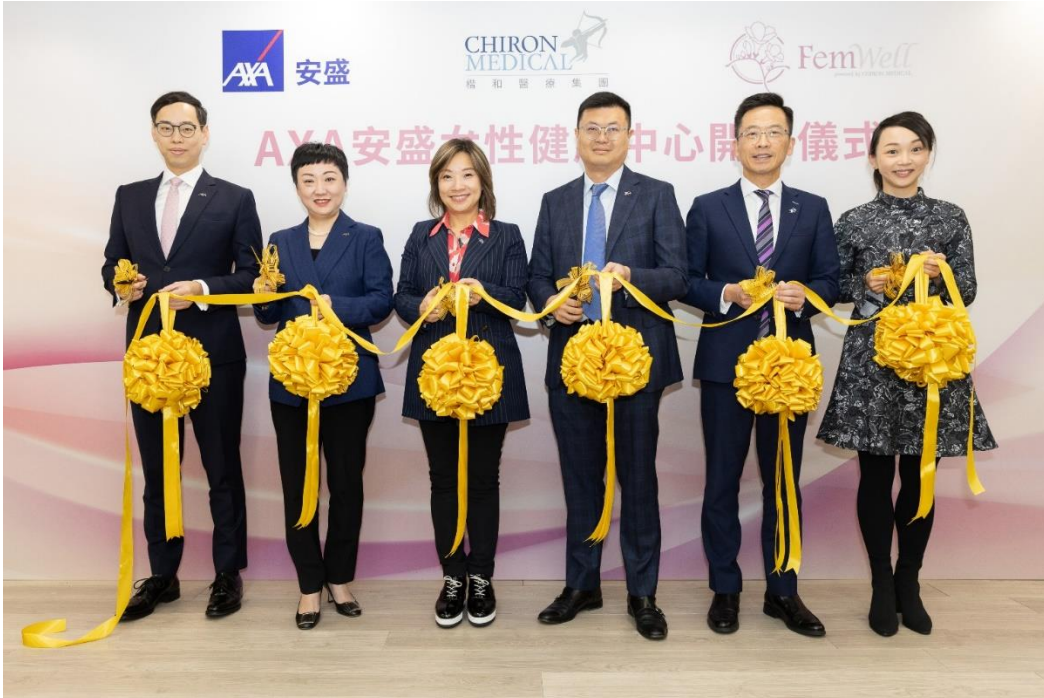
Photo 1: During the opening ceremony of the "AXA Women's Health Centre," the management teams of AXA and Chiron Medical Group celebrated their collaboration, pledged to provide high-quality, attentive medical services for women.